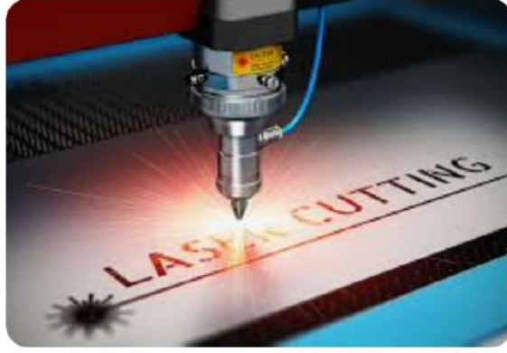
GWEIKE LASER 2500x6000 - 12kW laser power